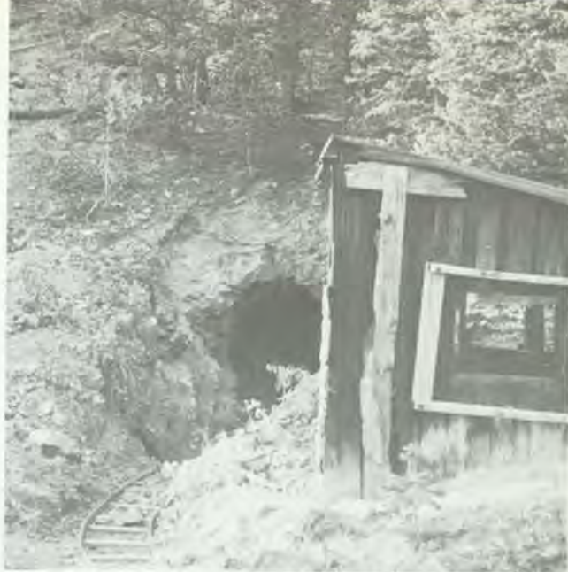
The adit and the shack (the original with some new repairs) of the Golden Chest Mine.