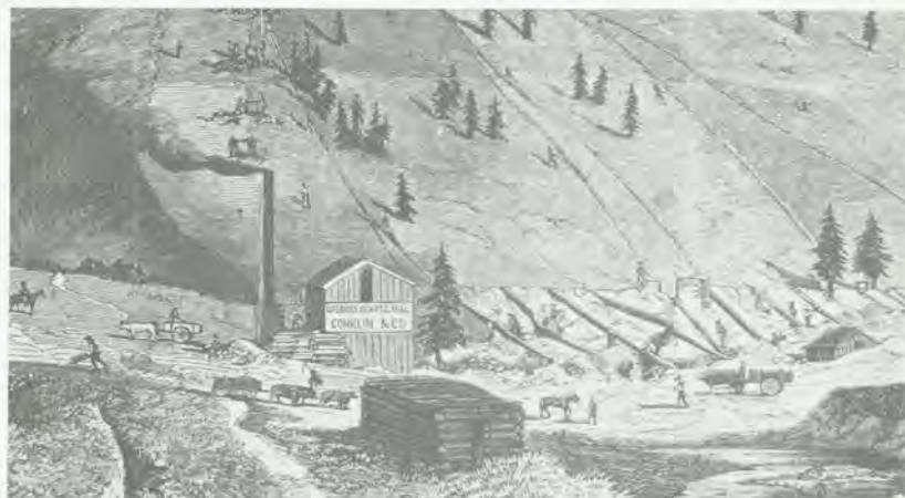
A sketch of Gregory Quartz Mill made on April 21, 1860.