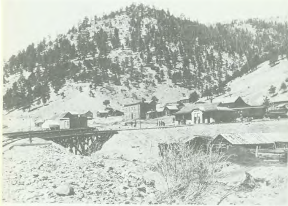
Sunset about 1900.

must have been better than marginal. There were 122 stockholders, placing the average investment in the neighborhood of $512 per stockholder. 29