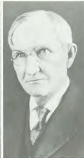
Governor William Adams (1927-1933).