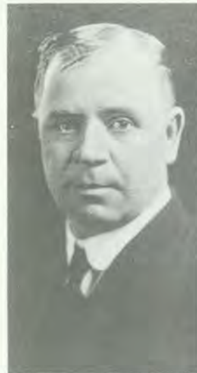
Governor George Carlson (1915-1917).

As might be expected, the seven men who served as governor between 1916 and 1933 differed in their thinking about prohibition. 47 For example, George A. Carlson vigorously supported