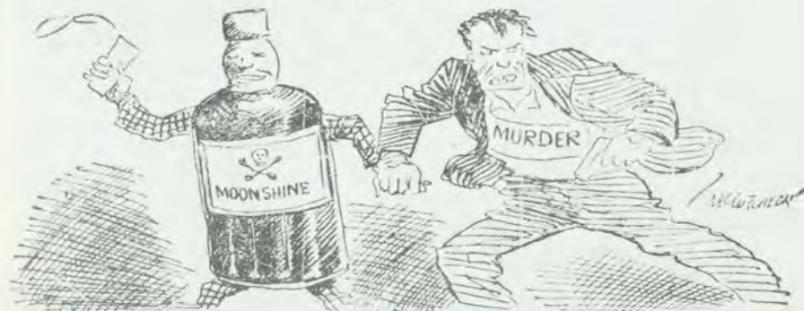
Nearly always hand in hand.