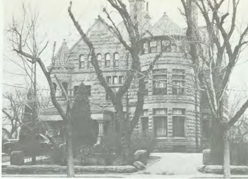
The James Bradley Orman home at 103 West Orman Avenue in Pueblo.

Financial reverses came to James B. Orman in 1908. The beautiful home on West Orman Avenue, of which they and the town were so justly proud, was included in personal assets auctioned in a bankruptcy sale. 31 The poignant story of its sale adds interest to one of the mansions that is now a public building: