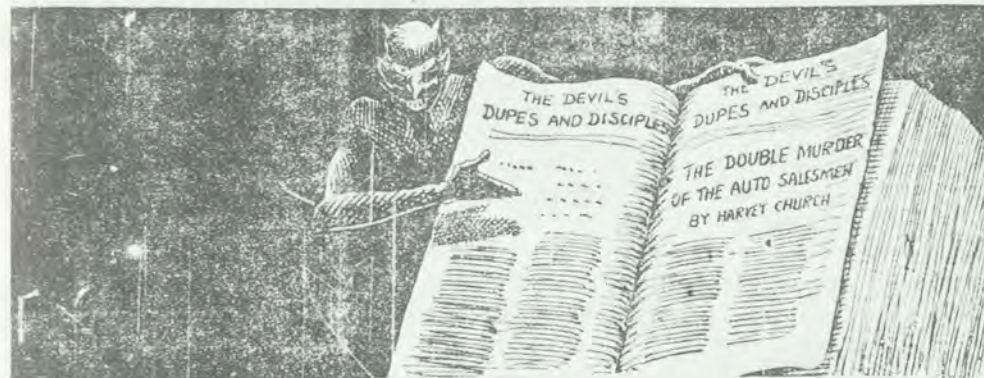
Pointing with pride.