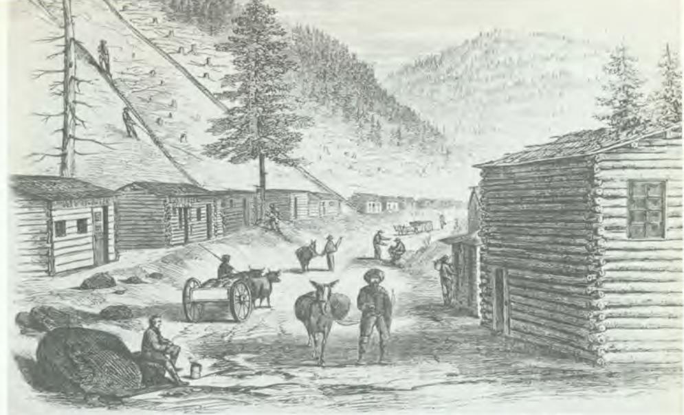
An on-the-spot sketch of a street in Gregory Gulch made on March 24, 1860.

of miles from the edge of civilization, the men struggled with crude tools, temporary housing, and just enough food to keep them strong enough to swing a pick; for physical necessities remained secondary to the flurry and excitement of getting rich. When they first arrived, Fergus confessed: