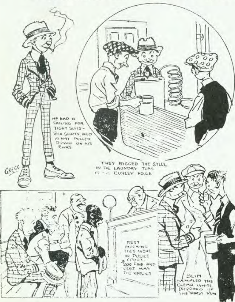
The Denver Post illustrates the folly of moonshining.