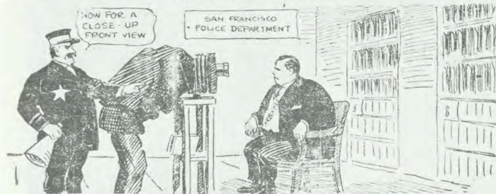
Starring in a real drama.