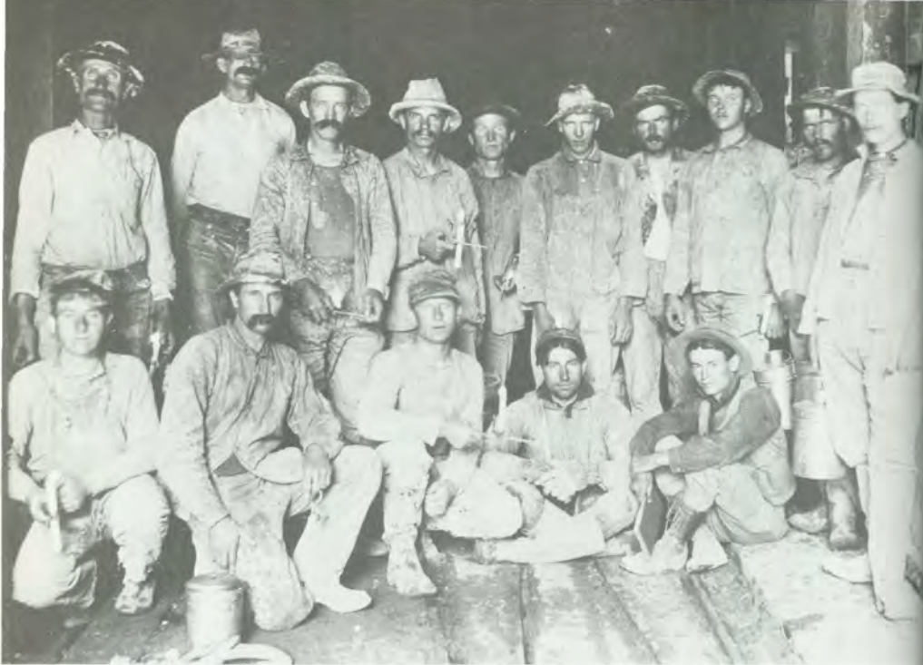
A flashlight view of the night force working in the west end of the Gunnison Tunnel on 3 July 1905.

under the official designation, the Colorado River Project in Mesa County. 52