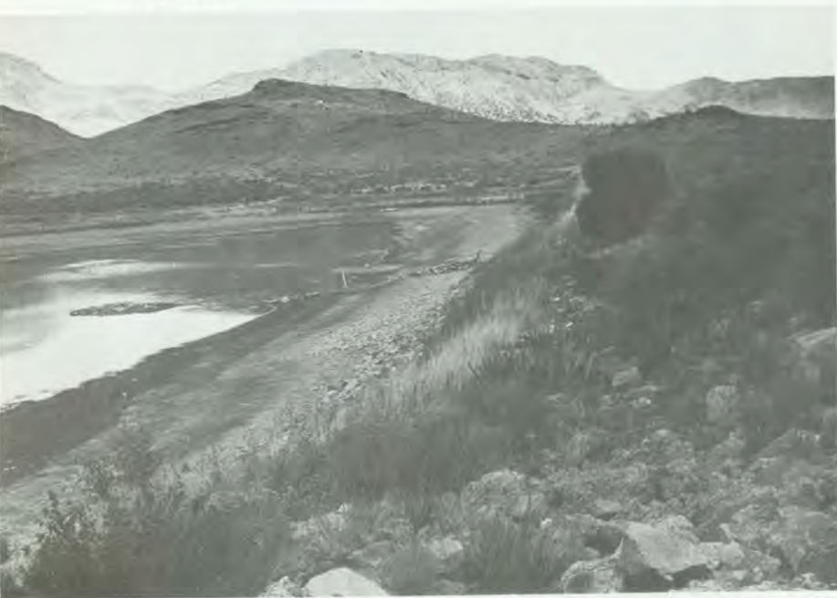
Saguache Reservoir dam, photographed August 1972.