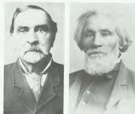
Barney L. Ford