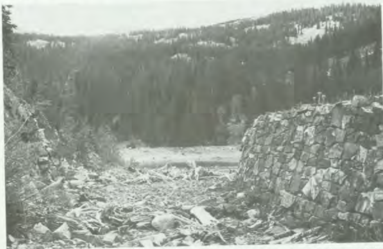
The spillway of the Boss Lake dam in August 1972.

After consideration of several sites, the Chaffee County project was located at Boss Lake just under the Continental Divide about two miles above the town of Garfield. During the