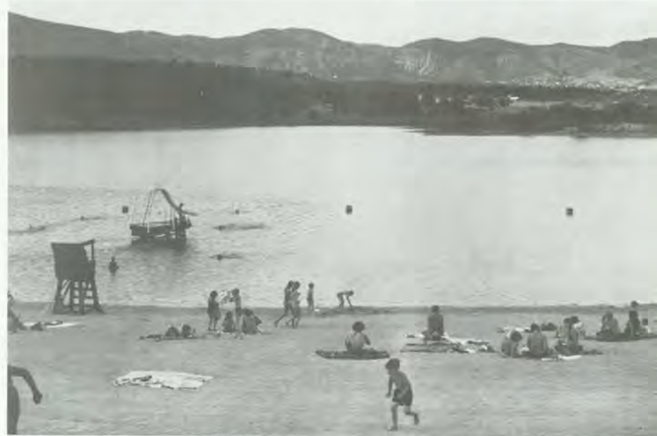
Enjoying Monument Reservoir in August 1972.

While attitudes toward the state canal projects were becoming increasingly negative, work on the five reservoirs authorized in 1891 progressed. The site for the El Paso County Reservoir was selected at the confluence of Monument and McShane creeks near the town of Monument. The reservoir was to have an es-