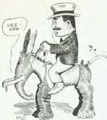
Teddy's Mount as Seen by Bryan