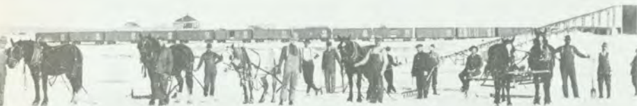
Clearing the snow off Monument Lake—