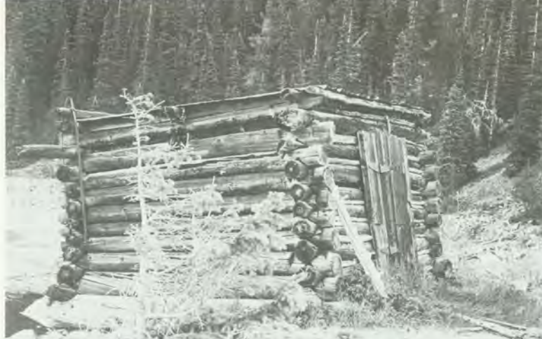
Control house at the Boss Lake dam (1972).