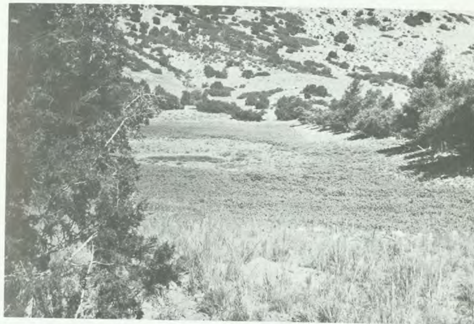
The Custer County Reservoir in August 1972.

A site near Wetmore was selected for the Custer County Reservoir. This facility was to be located "off stream" and was to be filled by a ditch, drawing water from Hardscrabble Creek.