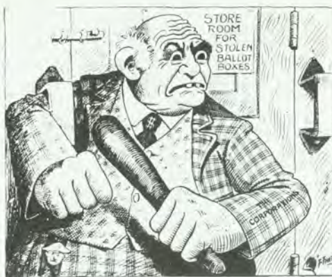
WITH HIS BACK TO THE WALL